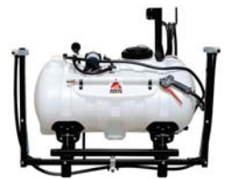
G8016 40g 3-Point