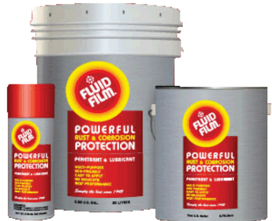
Fluid Film® - US Packaging