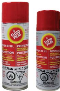
Fluid Film® - CAN Packaging