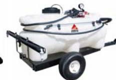
G8015 25g Tow Behind