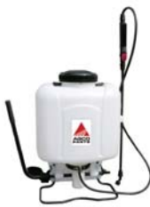
G8012 16L Backpack