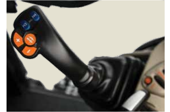
Multi-function Loader Joystick