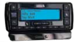
SSV7V1 Plug-N-Play Satellite Radio Tuner (provides satellite radio through your existing stereo radio.)