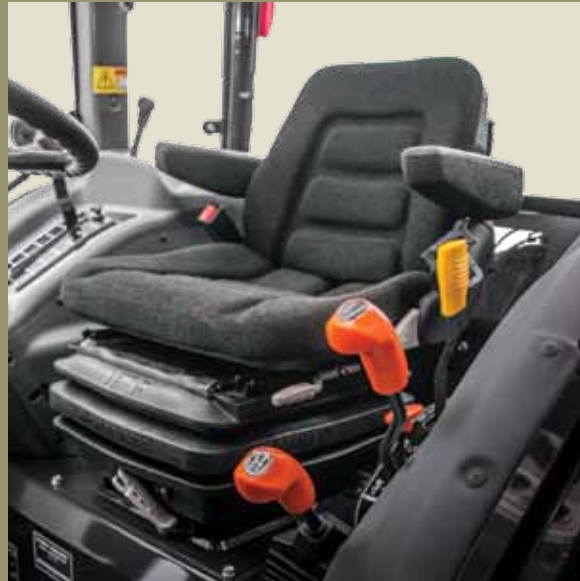
Suspended Operator's Seat

Massey compact tractors have been designed to help you do more work, be more productive, and have more fun. Here are some accessories to help finish the job. Have fun.