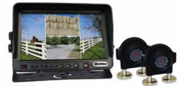
DMOV-7MQ-C2 - Double Camera Kit