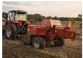
BALERS PAGE 56