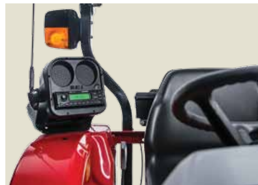
Fender-Mounted Radio (see page 39)