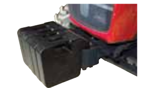
TRACTION CENTER: FRONT WEIGHTS & WHEEL WEIGHTS PAGE 44