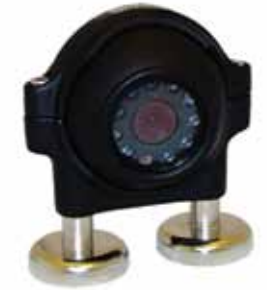
DMOV-RC - Camera