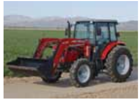
LOADERS PAGE 50