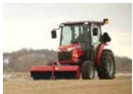
BLADES / BLOWERS / BROOMS / BACKHOES PAGE 58

Implements are available only through Dealer Central.