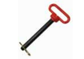
HITCHES & PINS PAGE 46