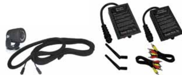
AC-C1 - Camera & Cable Kit

Visit AGCOAgCam.com to see all the AgCam products available for your tractor.