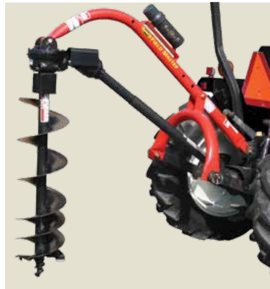
SP2404400 Post Hole Digger