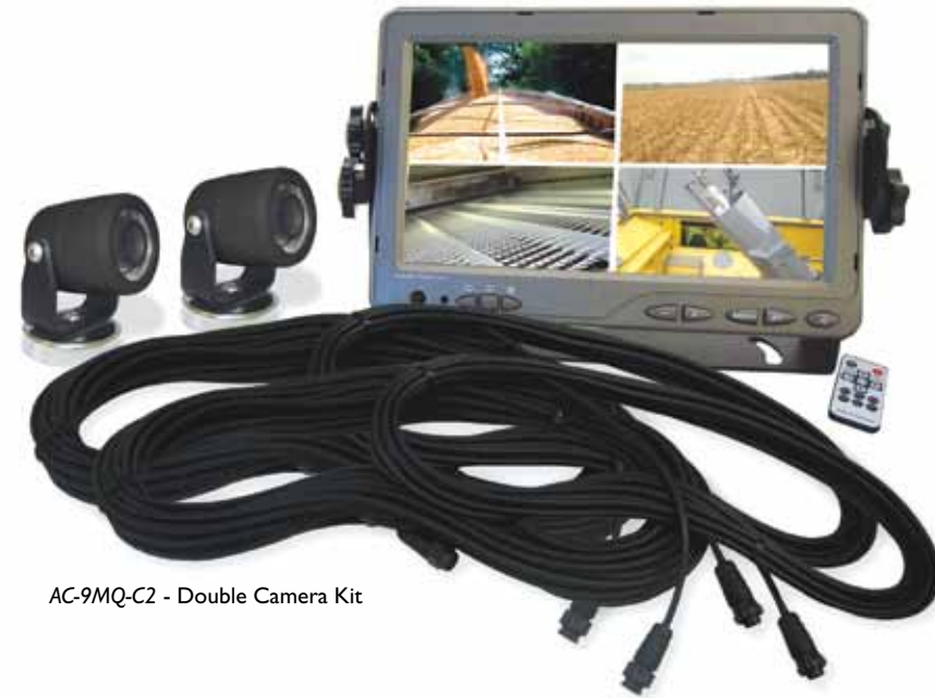
AC-9MQ-C2 - Double Camera Kit

When you buy an AgCam from AGCO, you get more than just another rear view camera system. You get the most durable, reliable, and easy to install camera on the market today. It comes from Dakota Micro, an American company that shares farmers' values and is a recognized leader in industrial camera technology. Check out the AgCam on YouTube or at WeCanBreakIt.com, to see how much abuse this innovative system can take.