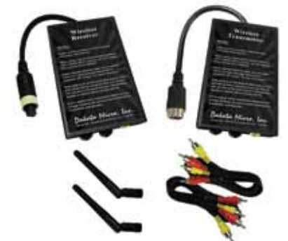
DMOV RHPAIR - Transmitter & Receiver