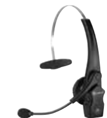
CBTH1-PLUS Bluetooth Headset