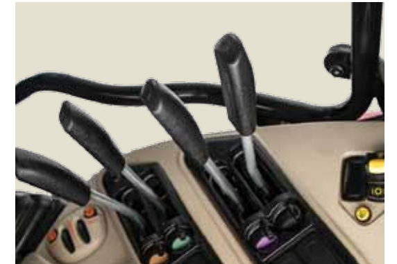
Rear Hydraulic Remote Valve Controls