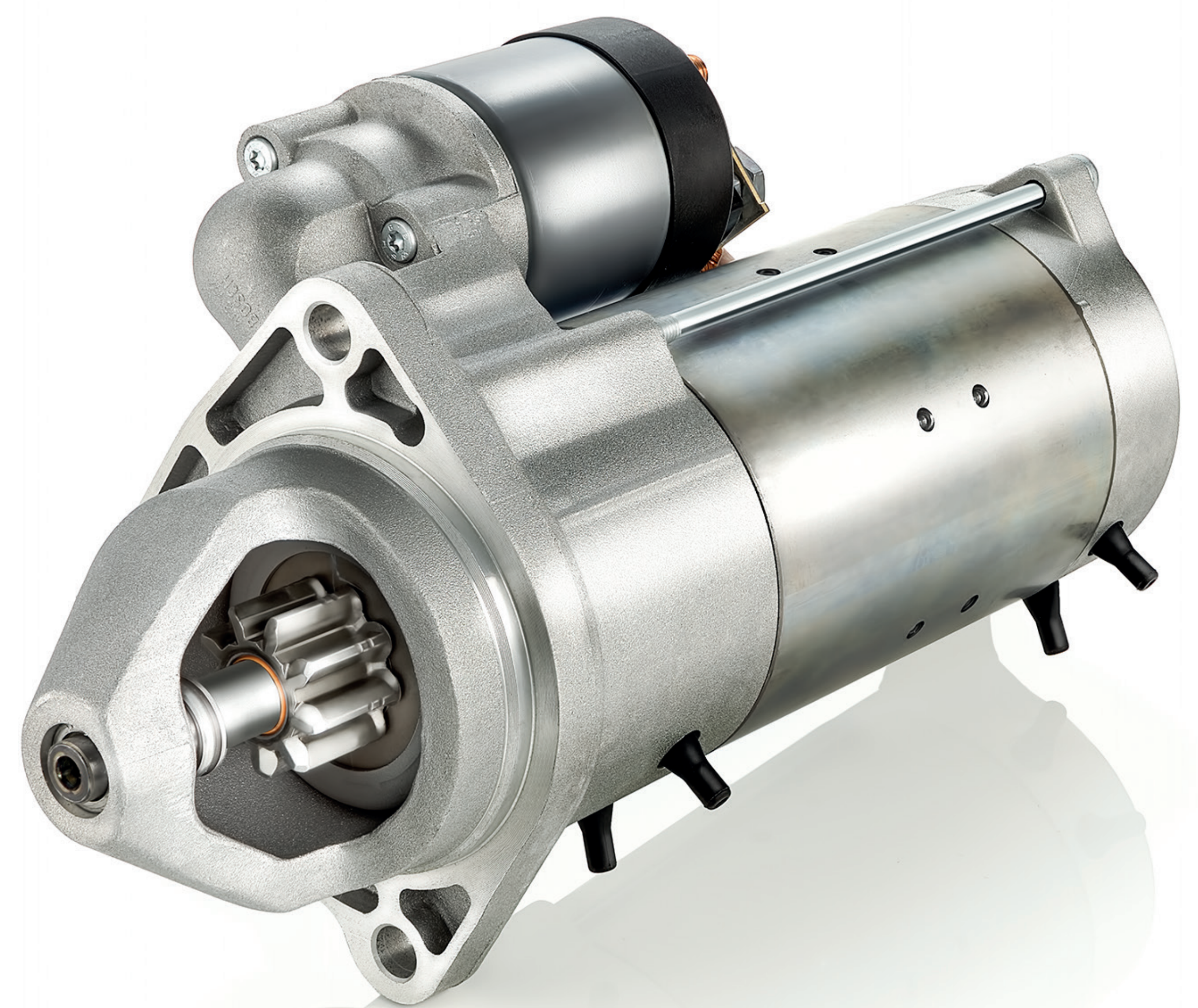
YOUR WORKING MACHINE