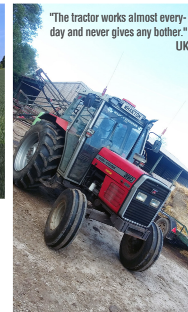
"The tractor works almost every-day and never gives any bother." UK