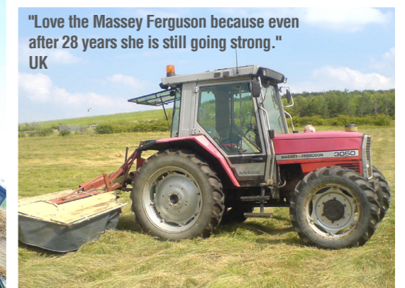
"Love the Massey Ferguson because even after 28 years she is still going strong." UK