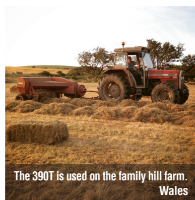
The 390T is used on the family hill farm. Wales