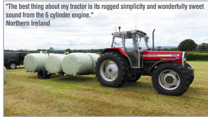
"The best thing about my tractor is its rugged simplicity and wonderfully sweet sound from the 6 cylinder engine." Northern Ireland