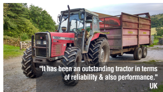
"It has been an outstanding tractor in terms of reliability & also performance." UK