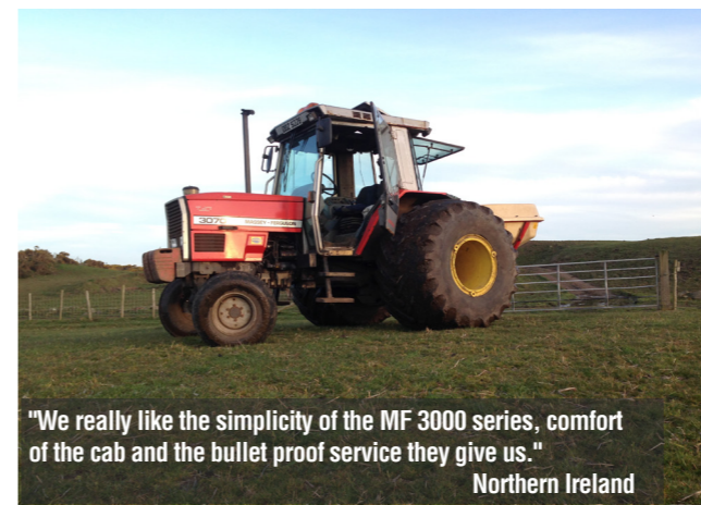
"We really like the simplicity of the MF 3000 series, comfort of the cab and the bullet proof service they give us." Northern Ireland