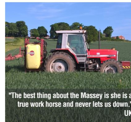
"The best thing about the Massey is she is a true work horse and never lets us down." UK