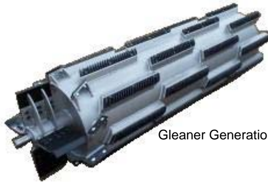
Gleaner Generation II Rotor

These fully enclosed, dynamically balanced rotors and cylinders eliminate internal trash buildup, reducing vibration. A secondary benefit of these heavy-duty units is the additional weight built in that maintains rpm for less "slugging," allowing lower operating speed for less grain damage. They are complete with black, chrome, or boronized cylinder bars installed.