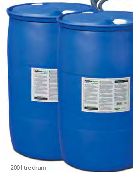
200 litre drum